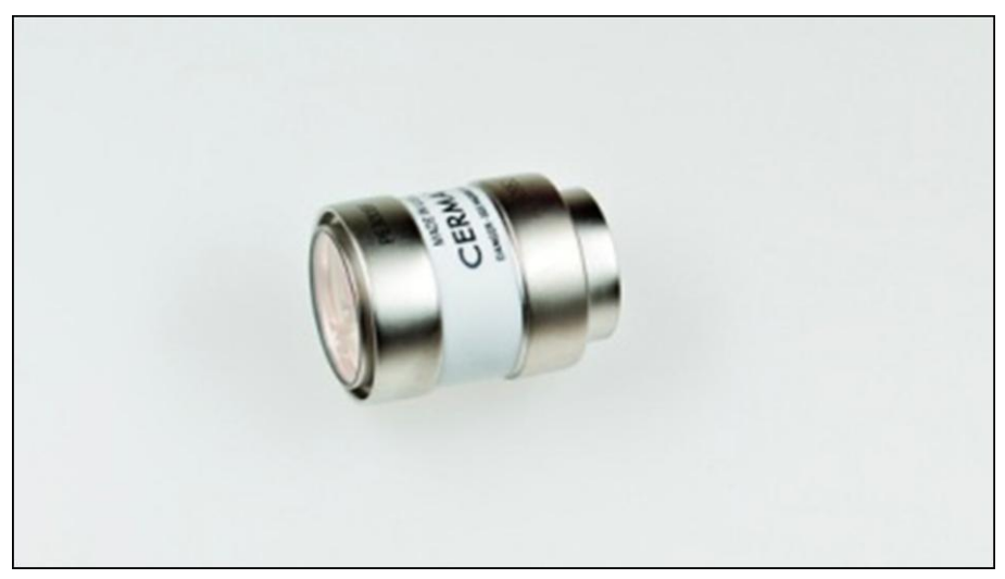
Cermax® Xenon short-arc lamps from Excelitas Technologies are ideal for applications that require a high degree of illumination control.

The Cermax® Xenon short-arc lamp from Excelitas Technologies is an innovative lamp design in the specialty lighting industry. Cermax® Xenon lamps were first introduced in the early 1980s and are now used in diagnostic and surgical endoscopes in most major hospitals worldwide, in high-brightness projection display systems, and for a wide variety of high-performance applications.